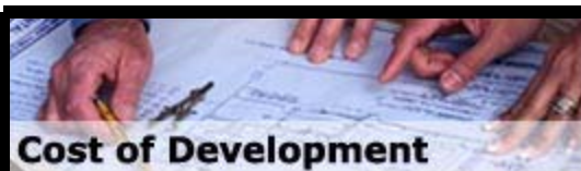
Cost of Development